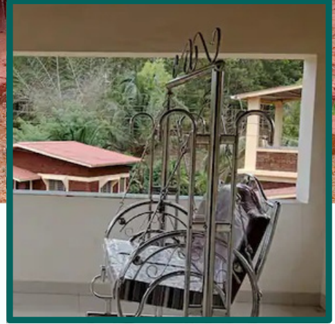
1st Floor Terrace